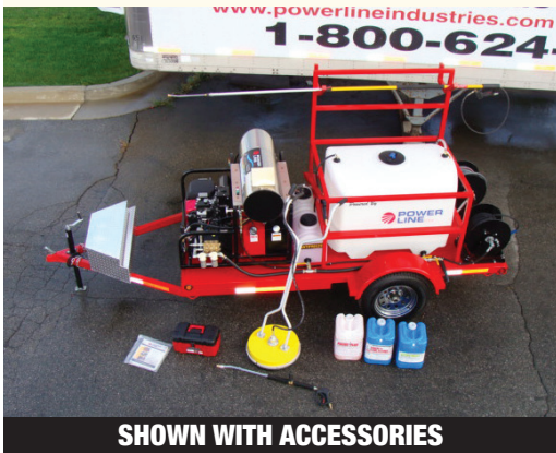
SHOWN WITH ACCESSORIES

Gas Engine • Diesel Heated HOT/COLD/STEAM PRESSURE WASHER Single Axle Series